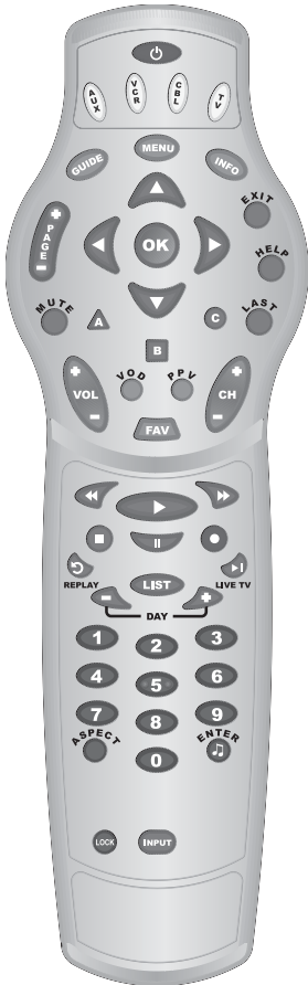
© 2004 ICX Global, Inc. All rights reserved Part Number ICX18344, version 1.0 07012004

VISIT US ON THE WEB YOU CAN FIND PROGRAMMING INSTRUCTIONS AND CODES FOR ALL OF OUR REMOTE CONTROLS, AS WELL AS INFORMATION ABOUT OUR OTHER PRODUCTS ON OUR WEBSITE: www.icxglobal.com